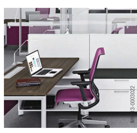
STORAGE TO PANEL CONNECTOR