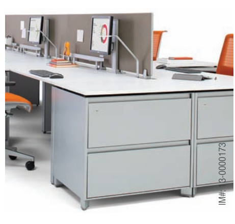
FLOATING TOP WITH FRAMEONE