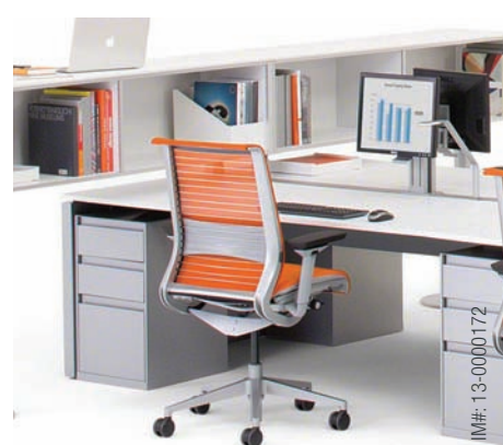
2H PEDS FOR FRAMEONE