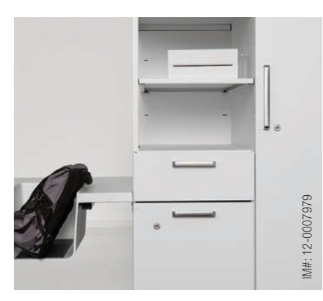
TOWER TO WORKSURFACE BRACKETS